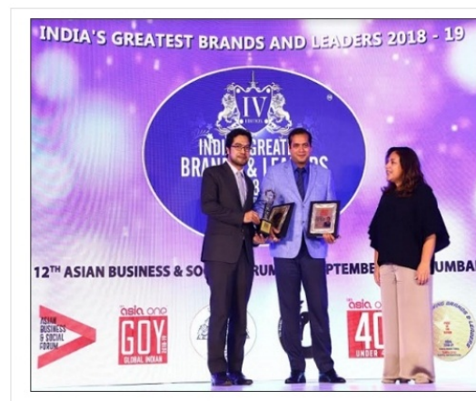
URS Media - 12th Edition Asian Business & Social Forum