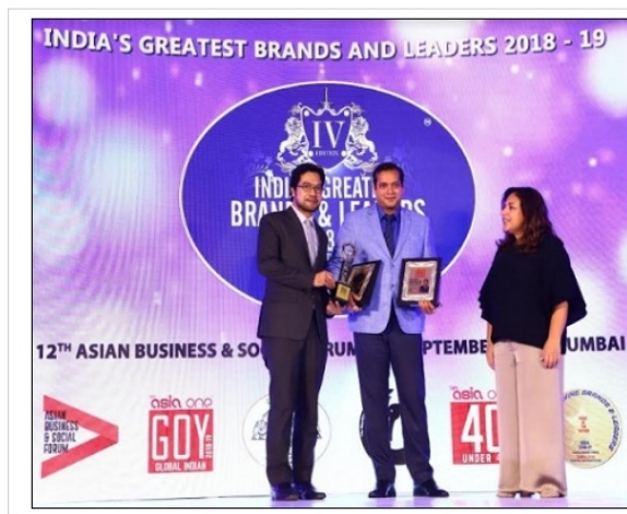
URS Media - 12th Edition Asian Business & Social Forum