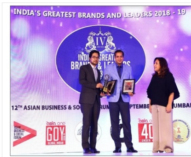
URS Media - 12th Edition Asian Business & Social Forum