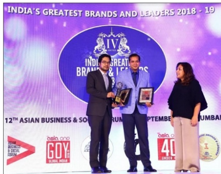
URS Media - 12th Edition Asian Business &amp; Social Forum