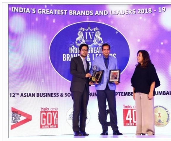
URS Media - 12th Edition Asian Business &amp; Social Forum