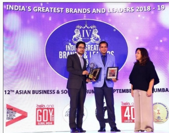
URS Media - 12th Edition Asian Business &amp; Social Forum