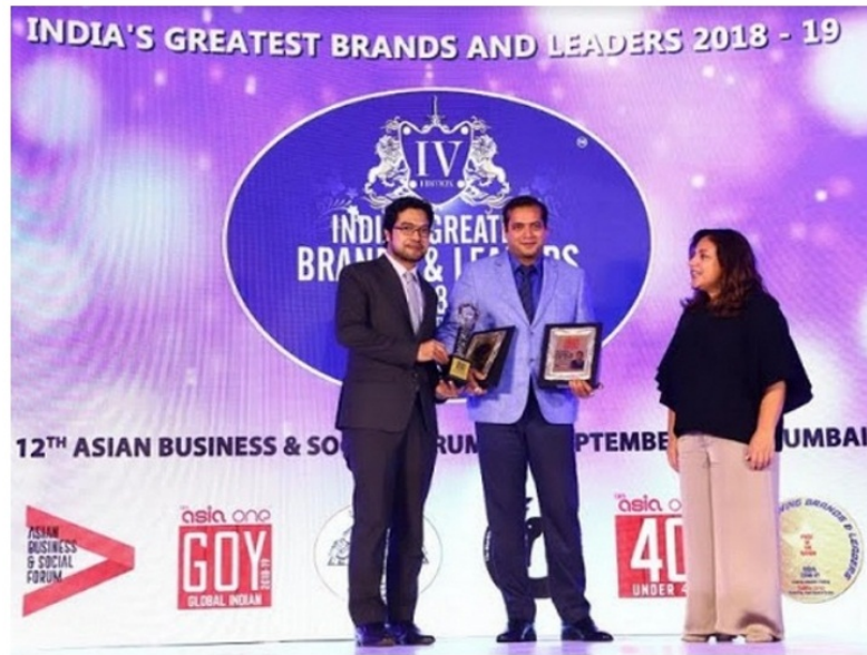
URS Media - 12th Edition Asian Business & Social Forum