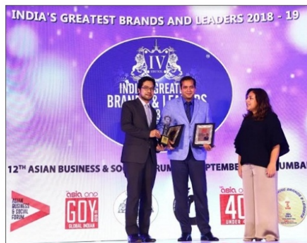
URS Media - 12th Edition Asian Business & Social Forum