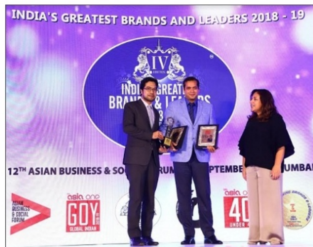
URS Media - 12th Edition Asian Business & Social Forum