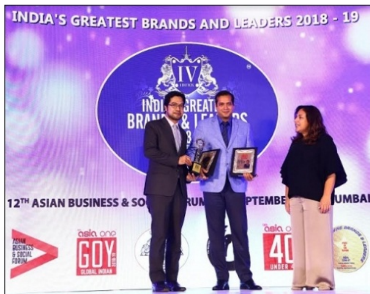
URS Media - 12th Edition Asian Business & Social Forum