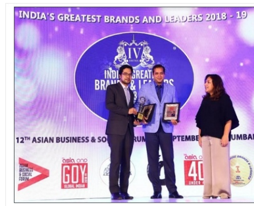
URS Media - 12th Edition Asian Business & Social Forum