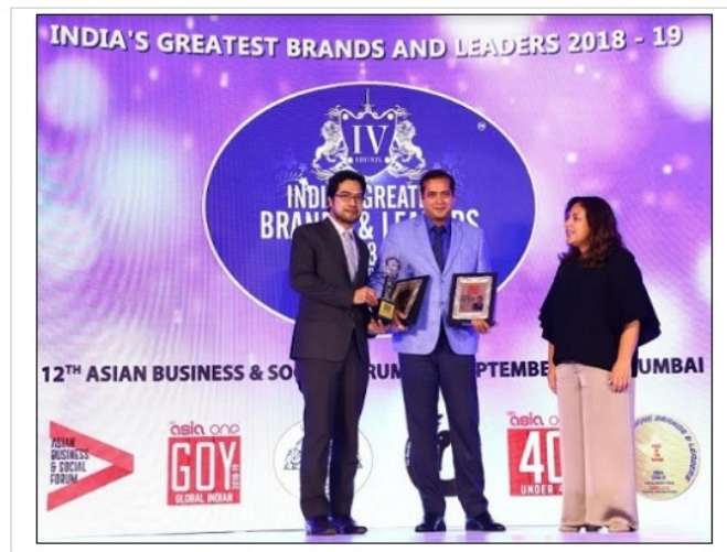
URS Media - 12th Edition Asian Business & Social Forum