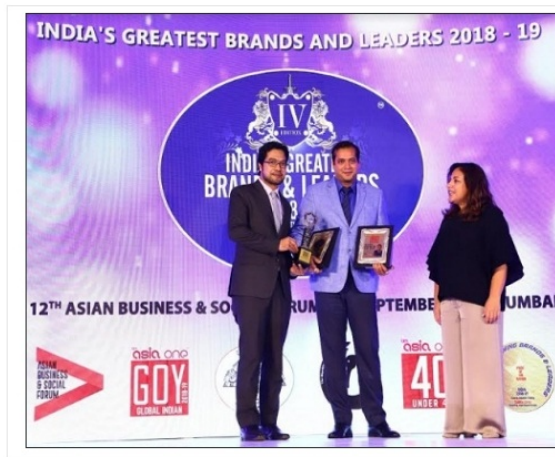
URS Media - 12th Edition Asian Business & Social Forum