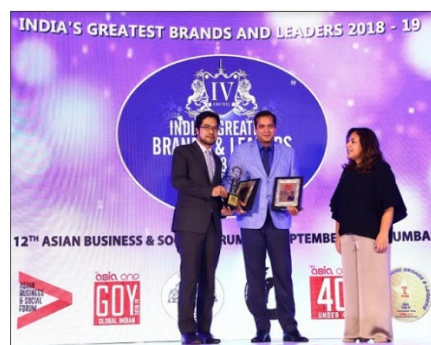
URS Media – 12th Edition Asian Business & Social Forum