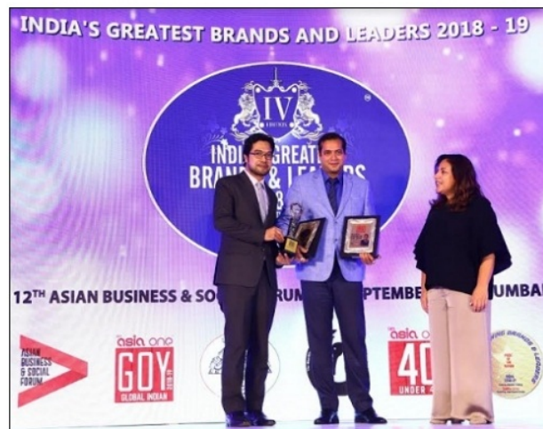
URS Media - 12th Edition Asian Business & Social Forum