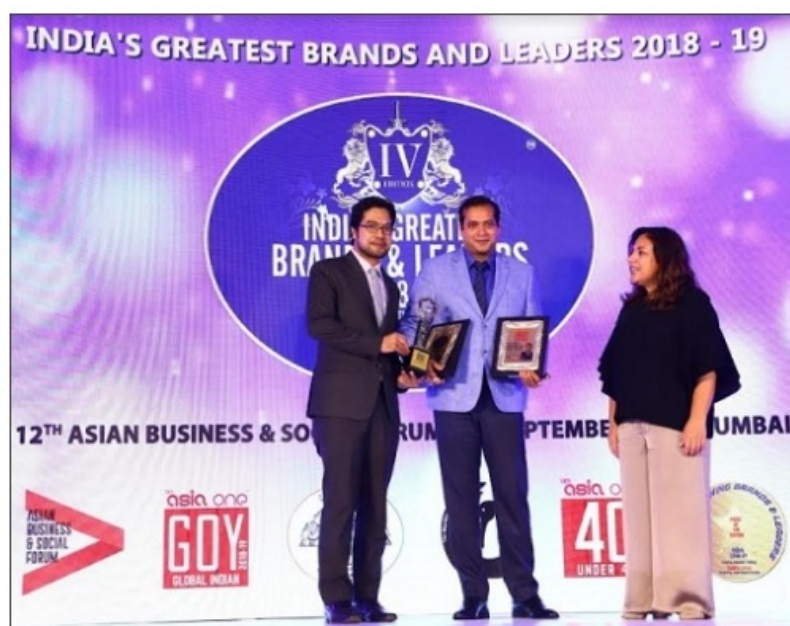
URS Media - 12th Edition Asian Business &amp; Social Forum