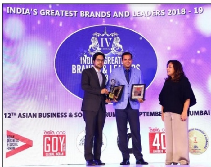
URS Media - 12th Edition Asian Business &amp; Social Forum