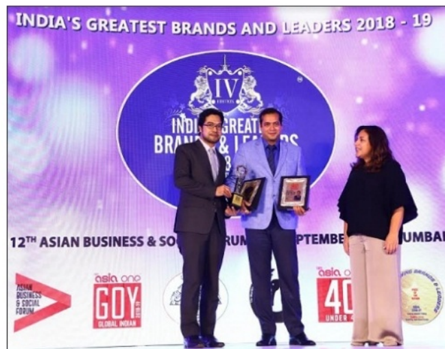
URS Media - 12th Edition Asian Business & Social Forum