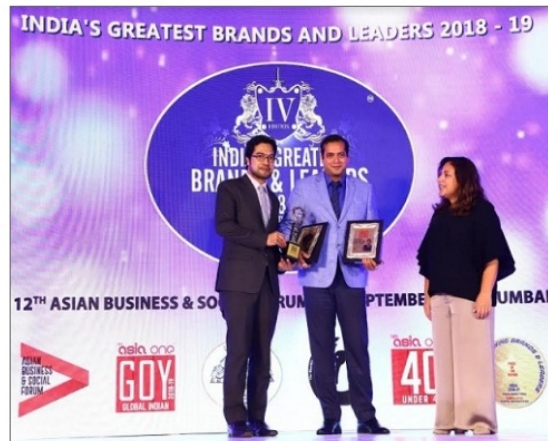
URS Media - 12th Edition Asian Business & Social Forum