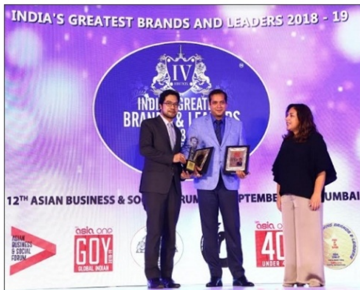
URS Media - 12th Edition Asian Business & Social Forum