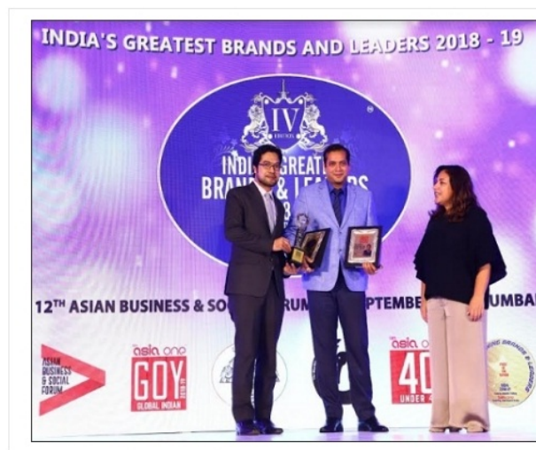
URS Media - 12th Edition Asian Business & Social Forum