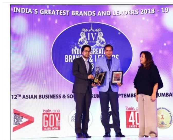
URS Media - 12th Edition Asian Business & Social Forum