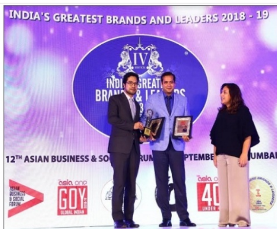
URS Media - 12th Edition Asian Business & Social Forum