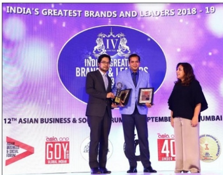
URS Media - 12th Edition Asian Business &amp; Social Forum