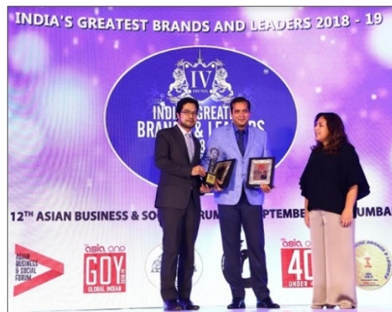
URS Media - 12th Edition Asian Business Social Forum