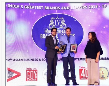
URS Media - 12th Edition Asian Business & Social Forum