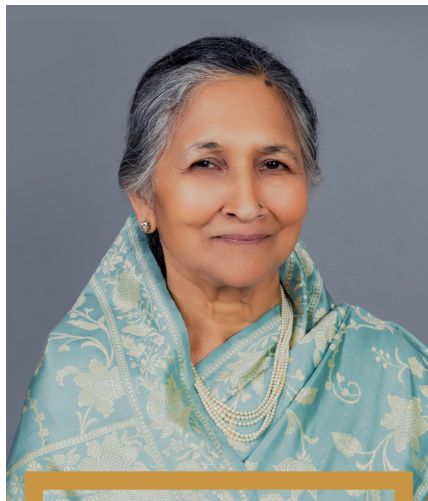
SMT. SAVITRI JINDAL CHAIRPERSON EMERITUS, OP JINDAL GROUP

India couldn't have acquired independence without the efforts of numerous extraordinary freedom