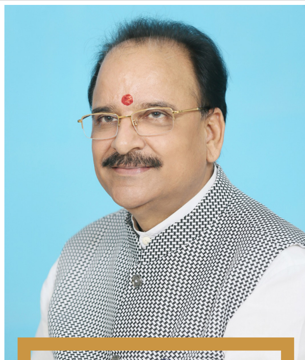
SHRI AJAY BHATT, HON'BLE MINISTER OF STATE FOR DEFENCE & TOURISM, THE GOVERNMENT OF INDIA

The launch of PM GatiShakti Master Plan in the year 2021 is marked as a special milestone in the ongoing Azadi Ka Amrit Mahotsav (AKAM), celebrating 75 years of independence of India. Reverberating AKAM's initiative of bringing together the achievements of all the States, Ministries, Departments, and the people of India, PM's GatiShakti is set to eliminate cross-departmental miscommunications and work together under a unified aegis. India has come a long way since Independence. We have marveled in the fields of science and technology, medicine, healthcare, and agriculture. Infrastructural development is the last link joining all these sectors together and advancing India towards greater collective development.