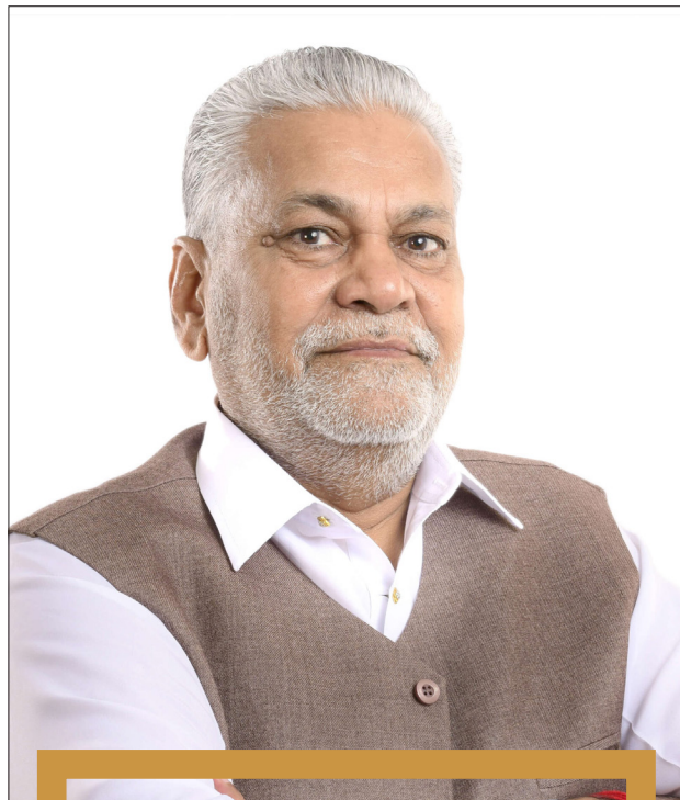
SHRI PARSHOTTAM RUPALA, HON'BLE MINISTER FOR FISHERIES, ANIMAL HUSBANDRY AND DAIRYING, THE GOVERNMENT OF INDIA

It is driven by Prime Minister Modi's clarion call of Sabka Saath. Sabka Vikas. Sabka Vishwas, Sabka Prayas. It encompasses Government policies, schemes, action plans along with commitments from businesses, NGOs, civil society that helps actualise our ideas and help us collectively create a better tomorrow. Programmes under this theme include initiatives such as