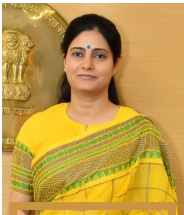
SMT. ANUPRIYA PATEL HON'BLE MINISTER OF STATE FOR COMMERCE AND INDUSTRY, THE GOVERNMENT OF INDIA