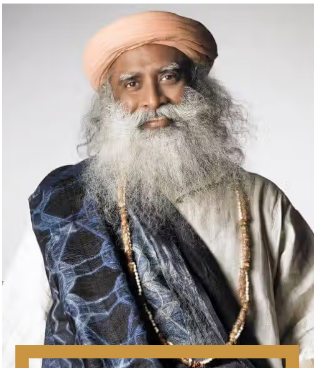
SHRI SADHGURU, FOUNDER, ISHA FOUNDATION